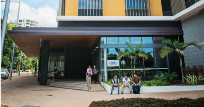
Darwin Waterfront, 21 Kitchener Drive