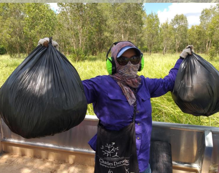
Wild harvesting O. rufipogon in April 2021, Fogg Dam Reserve, Wulna Country, Adelaide River