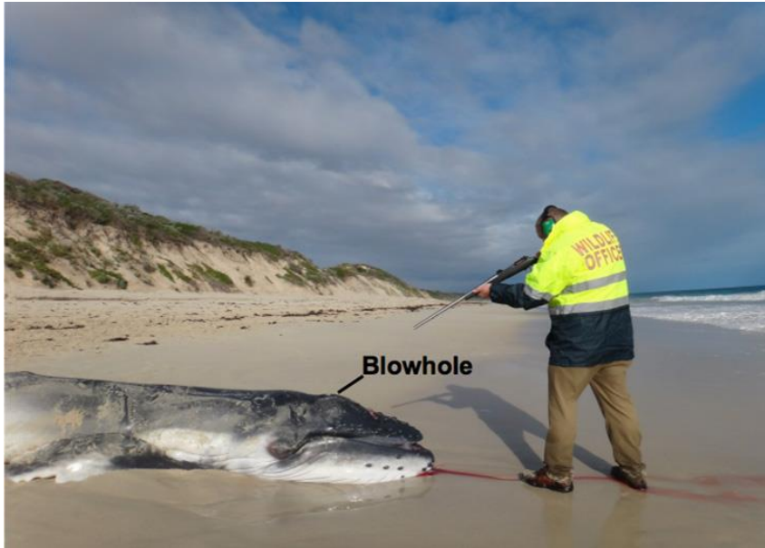
Figure 3 Lateral view, demonstrating the recommended shot distance.