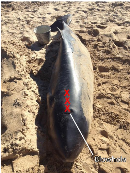
Figure 1 Dorsal view, indicating the recommended aim points for three successive shots, relative to the blow hole.

Shooting should always be directed to the dorsal surface of the animal, aiming slightly posterior to the blowhole and angled backwards at 45° (see Figures 1, 2 and 3) along the midline of the animal. This aim point corresponds to the vital centres of the animals' hindbrain, which lie midway between the eye and pectoral fin when the animal is viewed laterally (see Figure 2). The shooter should be standing 0.5-1m in front of the animals' head such that the muzzle of the rifle barrel is also 0.5-1m from the animals' blowhole at the time of shooting (see Figure 3).