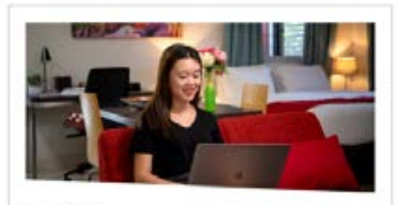
Students Register to get contact information for listings, save listings to your shortlist and more.

Finding a place to live is one of the biggest decisions faced by University students. CDU StudyStays provides a listing of accommodation vacancies around the Charles Darwin University campuses offered by private providers.