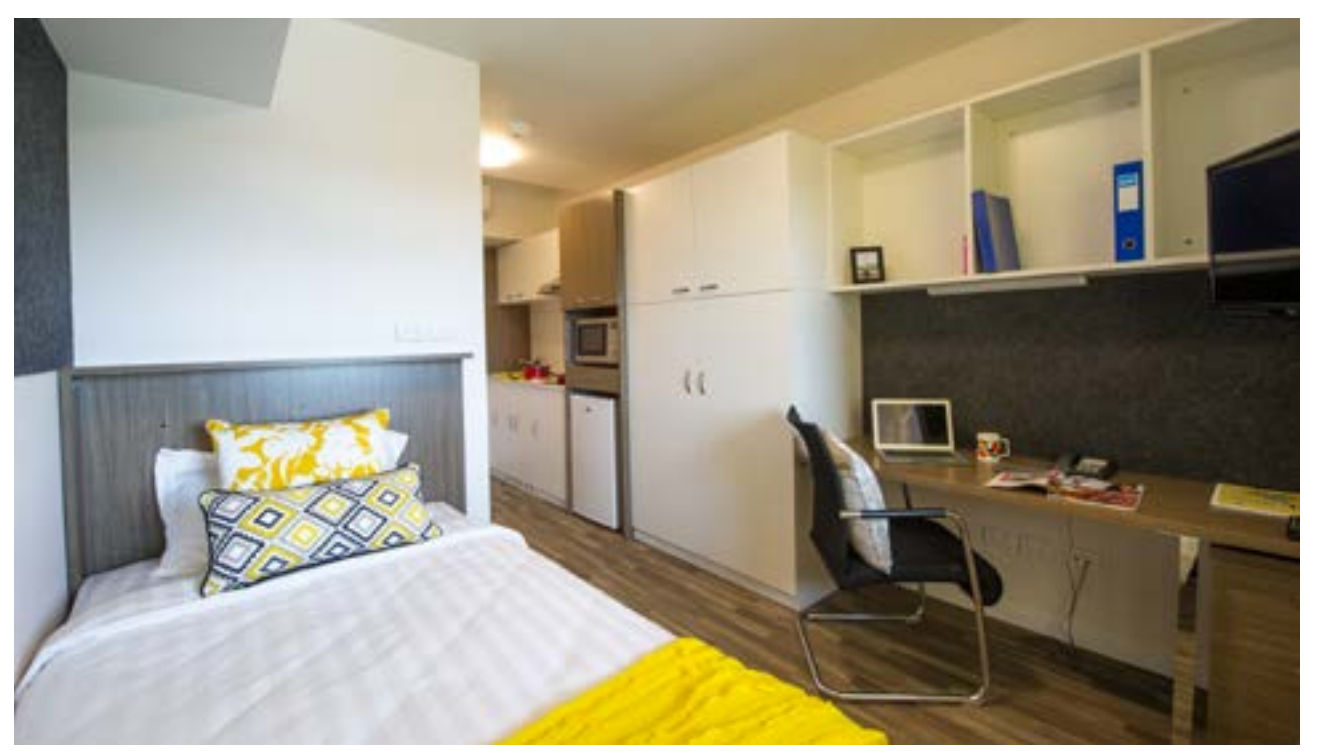
Studio Apartment with Balcony